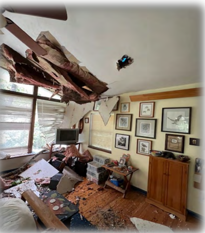
May 10 storm damages a First Presbyterian Church of Tallahassee member's home

The costs to our community are still being compiled. Forty-six buildings were destroyed, and 550 homes and businesses damaged by trees. The cost for the two families who each lost a family member cannot be reduced to a number. The home in the photo has been damaged by three different storms over the